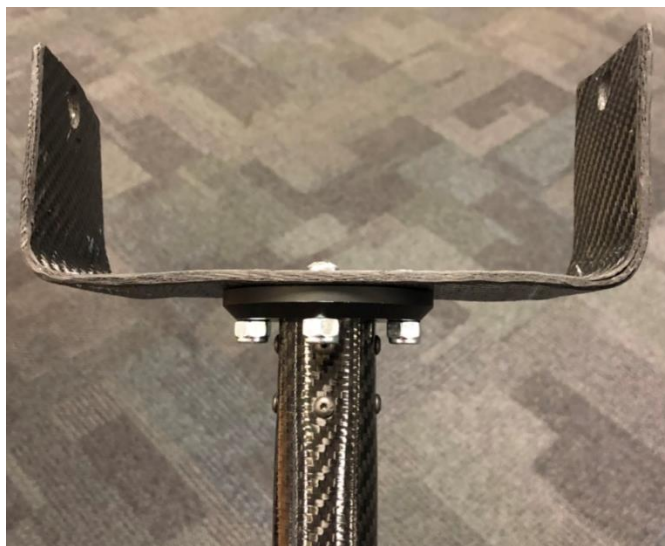
Figure 8: U-shaped attached by the pylon attachment

The attachment was ordered from Rock West Composites, the attachment goes in between the U shaped and inside the pylon. Screw in the 8 screws in to it from the outside of the pylon and place 4 bolts in the top to secure it on the U-Shaped Support.