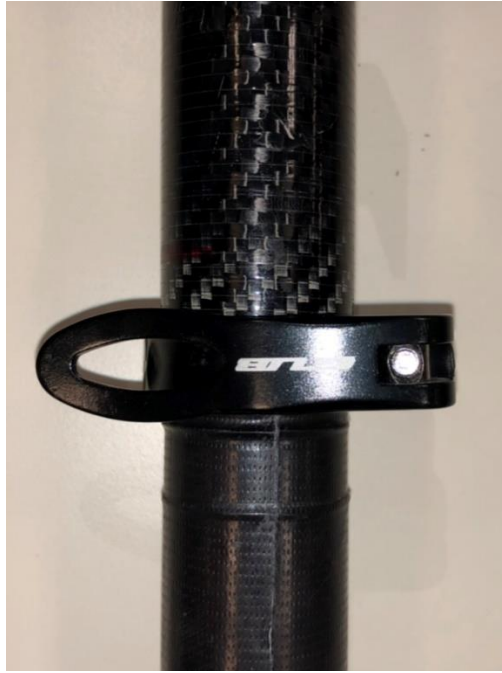
Figure 2: Adjusting device height