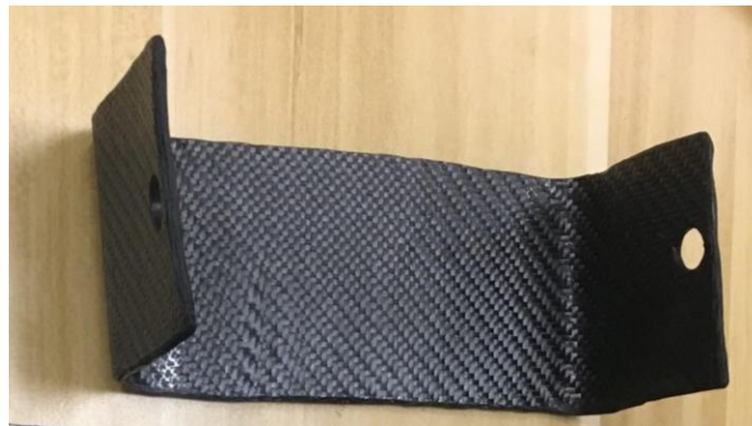
Figure 6: Carbon fiber U-shaped

Cut 12 layers of prepreg carbon fiber and use the same process as the carbon fiber leg supports. Once U-bar is cured, drill two holes on each side of the shape to fit the shoulder bolt. In the base of the Support drill 4 holes to fit the 4 bolts that are going to attach the pylon with the U-Shaped support.