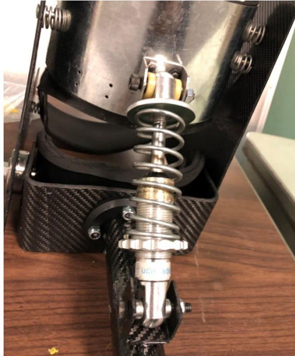
Figure 10: Coil shock attached to the calf cuff and upper pylon