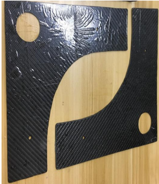
Figure 4: Carbon fiber leg supports

Cut 8 desired shapes out of prepreg carbon fiber and stack them up on top of each other. Place them in a plastic bag and secure bag with gummy tape so there are no air leaks. Use a vacuum air pump to remove all remaining air in the bag. Place the layup in an oven that is set in 135 degrees-Celsius for 120 minutes and take it out to cool in ambient temperature for 24 hours. Once its shape is formed, apply a coat of epoxy to give the product a nice finish. Lastly, drill holes in both supports to fit the bearing and the Chicago bolts.