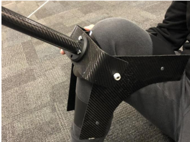
Figure 1: Securing leg in the device

Sit down on a chair or on the ground so your knee is bent at a 90-degree angle. Place device over bent knee and secure to the leg using the two Velcro straps, one across the thigh, and one across the calf. Make sure to adjust the size so it fits snug around the leg.