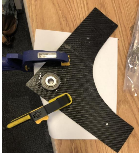
Figure 5: Epoxying bearings to the leg supports