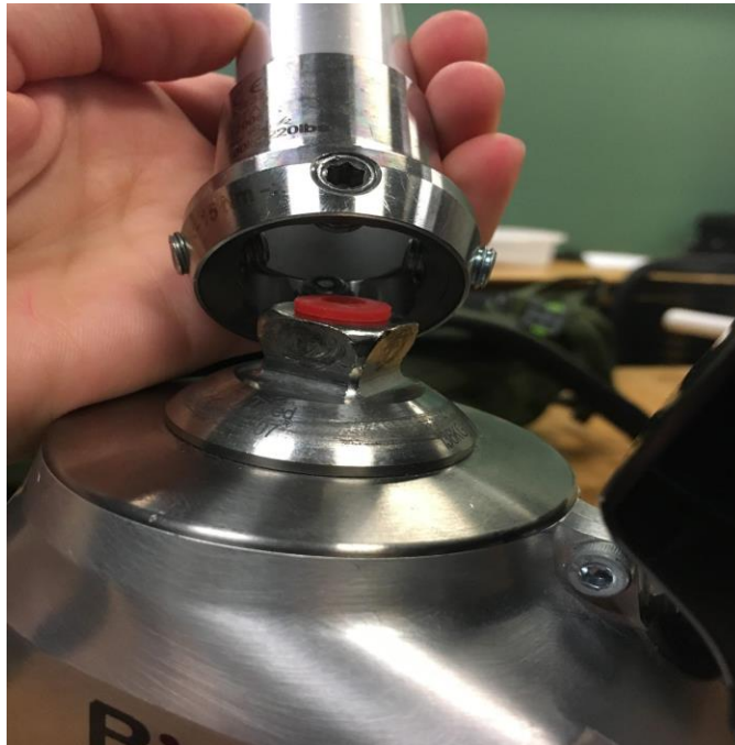
Figure 3: Attaching BiOM to adapter

The pylon adapter will be attached to the BiOM using 4 set screws as shown below in Figure 3. Make sure all set screws are loosened before placing over BiOM. Place pylon adapter directly over BiOM and tighten each set screw with an allen key making sure to turn one screw about one revolution before moving to the next in a cross-like pattern.