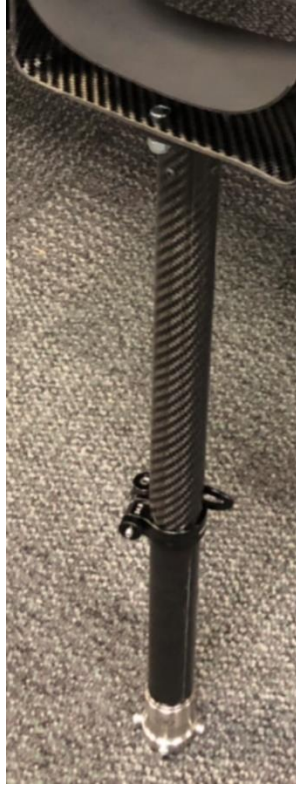
Figure 7: Pylon