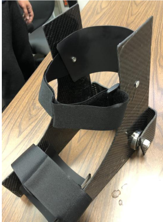
Figure 9: Upper device assembled together

Ensure the heat gloves are used during this step. Cut the desired shape out a flat thermoplastic using a band saw. Heat the flat plate of thermoplastic using a heat gun until it is malleable. Placed a towel on a team member's leg and place the hot thermoplastic over the towel to mold to the leg. This was done for the knee, thigh, and calf cuffs. Lastly, attach the Velcro straps to the cuffs and to the carbon fiber leg support using Chicago bolts.